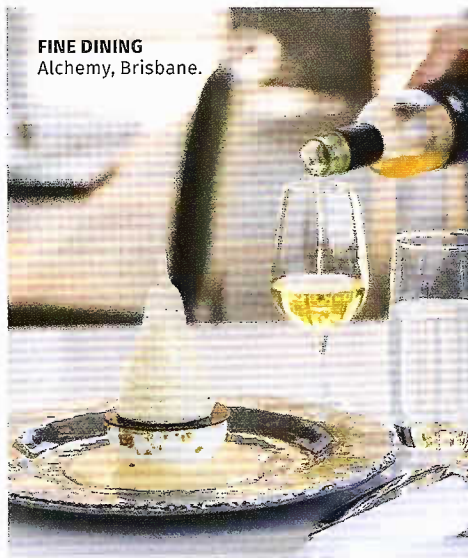
FINE DINING Alchemy, Brisbane.